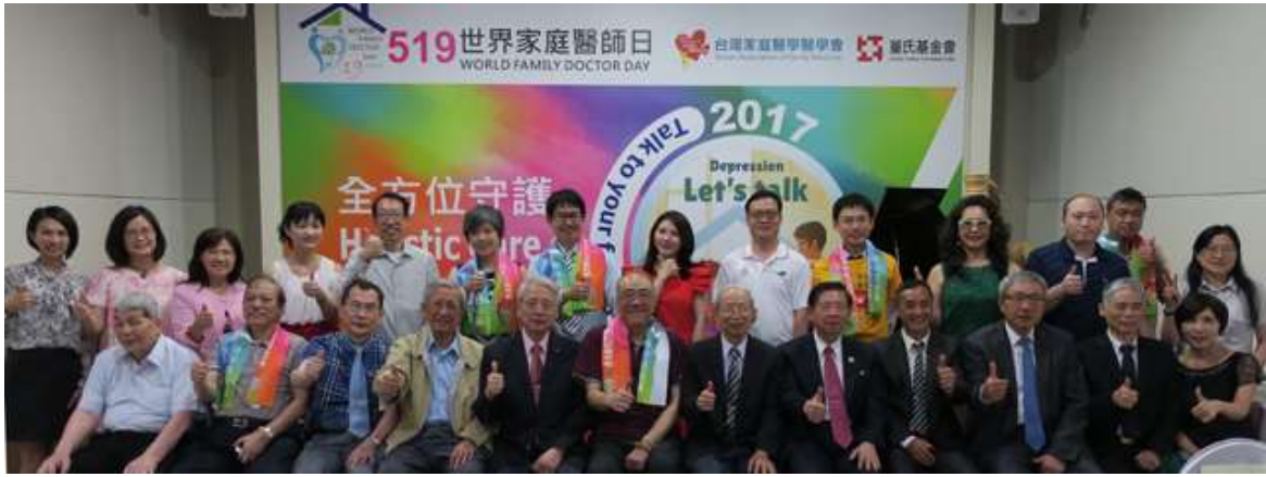
For more information on Taiwan's activities see feature in WONCA News May 2017

Chinese Taipei (Taiwan) Association of Family Medicine (TAFM)